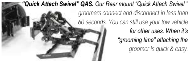
"Quick Attach Swivel" QAS. Our Rear mount "Quick Attach Swivel" groomers connect and disconnect in less than 60 seconds. You can still use your tow vehicle for other uses. When it's "grooming time" attaching the groomer is quick & easy.

Rear mount "Quick Attach Swivel" groomers swivel when you groom to create a nicer finish. Most competitor rear attached groomers are rigid when grooming (they don't swivel) and they can't produce the same finish. We've combined rear quick attached and swivel technology that no competitor has accomplished.....it's an engineering feat only mastered by Heying Company.