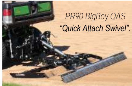
PR90 BigBoy QAS "Quick Attach Swivel".

For those who need the convenience of "easy travel" our direct mounted "Quick Attach" models remove the burden of tongue towing a groomer (or having to trailer it) to go from one location to another.