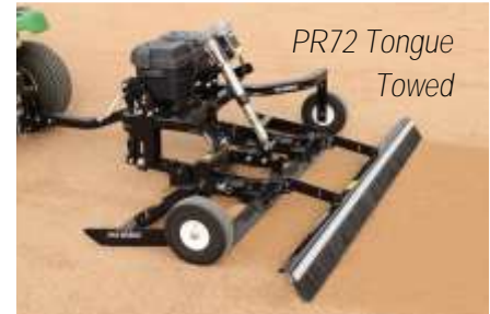
PR72 Tongue Towed