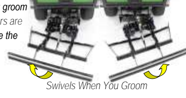
Swivels When You Groom

Rear mount "Quick Attach Swivel" groomers swivel when you groom to create a nicer finish. Most competitor rear attached groomers are rigid when grooming (they don't swivel) and they can't produce the same finish. We've combined rear quick attached and swivel technology that no competitor has accomplished.....it's an engineering feat only mastered by Heying Company.